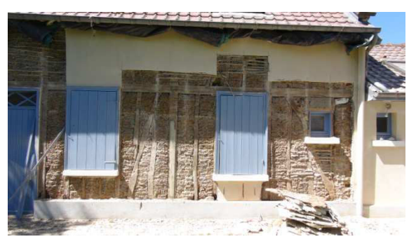
Fig. 5: Removal operation of the coating of cement and the wattle and daub

A first construction site of renovation of a house was accomplished with a rape straw concrete developed in CODEM. It was led by an artisan approved by the association "Construire en chanvre" and a carpenter specialized in renovation of old buildings. The renovations were carried out on a typical Picardy house, built with wooden panels and the wattle and daub. To which was applied a cement coated on the outside and plasterboard inside, following a renovation in the seventies. The goal of the renovation is obviously the complete replacement of the wattle and daub by a rape concrete. Figures 5 and 6 show the composition of the wall and the start of renovation work (removal of the wattle and daub and replacement of deteriorated wood sides). The figure 7 shows wall ended after the implementation of the pouring of rape concrete in formwork and after 3 weeks of drying.