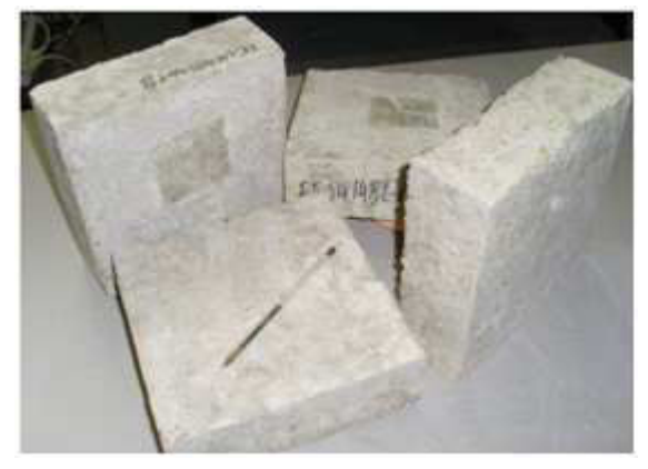
Fig. 4: Specimens after tests and drying

The total immersion tests were also performed on these materials. The objective of which is on the one hand, to assess in case of inundation the quantities of water absorbed and on the other hand to appreciate visually the degradation of the material in contact with the water and possibly after drying. The average value obtained is of the order of 84% and the standard deviation associated with these measures obtained is very low (0.2 %). We noticed no deterioration or loss of samples during 28 trial days or even after drying in the ambient air. This behavior shows the maintaining of the mechanical performances of rape concretes in case of complete submersion of the product. He confirms so results got with capillarity tests. Nevertheless, these tests confirm that once the rape straw aggregates are mixed with lime, their sensitivity to water decreased significantly, which certainly improve their durability in the event of accidental contact with water. The status of the specimens after 28 days of testing and after drying outside is shown on figure 4.