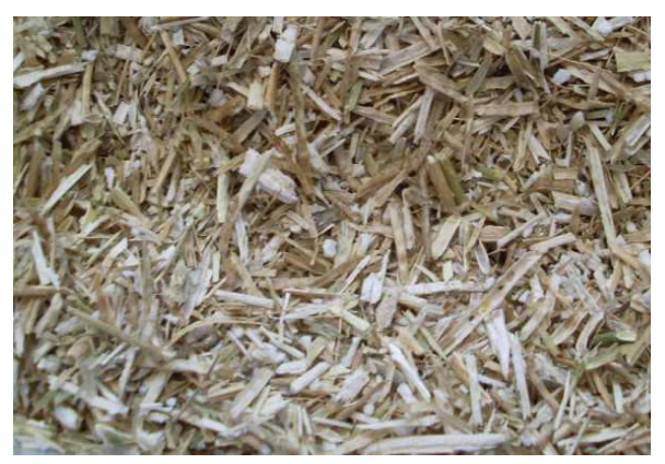
Fig. 1: Crushed rape straw

Today there's no n rape straw collection die, it is often left in the field after recovery of the seeds. This resource today has great potential in terms of volume. The rape straw was crushed by a combine harvester, which has to have spread out an enough granulometry, where the size of the particles varies from 0 to 35 mm. Figures 1 and 2 show the appearance of rape straw aggregates crushed and the microstructure of a rape straw particle. It is found that the rape straw has a high porosity.