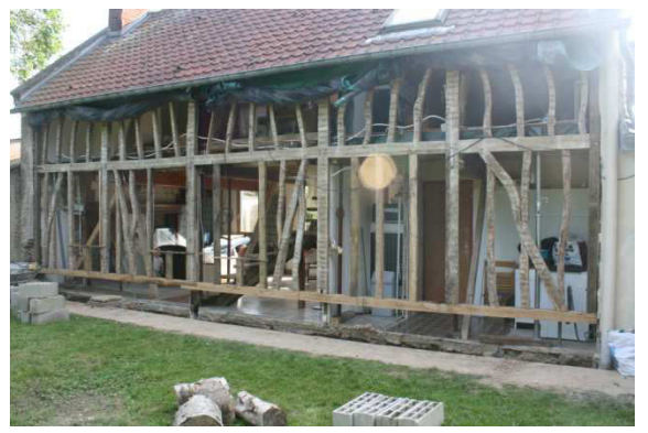
Fig. 6: Wall ready to receive the rape concretee