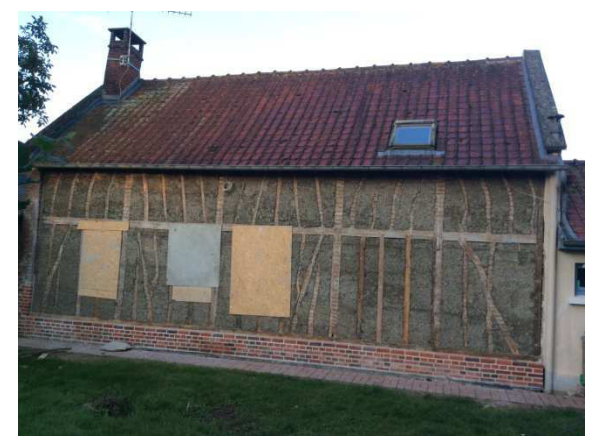
Fig. 7: Finished wall

This photo (figure 7) was taken after 3 weeks of drying. After this period, we have found a very good holding and very low dimensional changes relating to drying of the rape concrete. This rapidity of drying will present a great advantage of the use of this type of biobased concrete compared to the hemp concrete, which often requires the drying times longer.