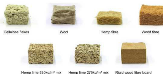
Figure 1: Insulation specimens

Factory manufactured insulation materials were supplied directly from the production line. The hemp lime mixes were prepared under laboratory conditions following mixing guidelines. The insulation materials were manufactured and prepared to a standard thickness of 50 mm.