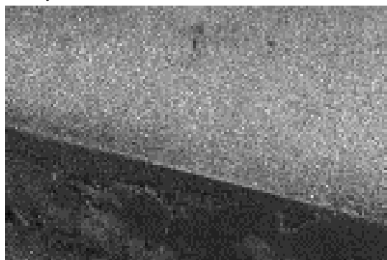
Fig. 2: Picture of the F5 Formulation

With an average porosity size near 0.5 to 1mm, the second formulation series seems to be better to obtain a lightweight foam but not enough homogenous and we can observe in lower part of material a bigger porosity.