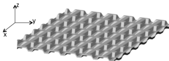
Fig. 1 : Aluminum mold for manufacturing wood-strand core.

the core geometry [Voth 2009]. An Aluminum mold was designed for pressing a thin-walled core composed of small-diameter timber strands [Voth 2009]. The core geometry is a biaxial corrugated shape with continuous ribs in the x-axis and segmented ribs in the y-axis as shown in Figure 1.