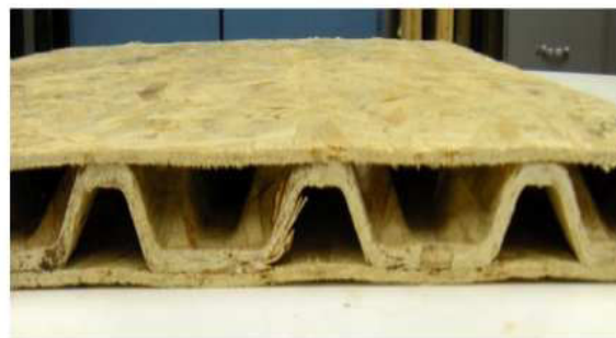
Fig. 2: Sandwich panel fabricated with thin strand plies and 3D strand core

strength and modulus following ASTM standards for sandwich panel constructions [ASTM 200a,b].