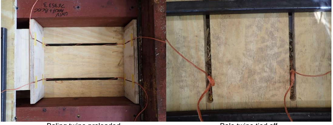
Baling twine preloaded

A series of six specimens for each prototype bale (measuring approx. 400 x 150 x 150 mm; average density = 112 \text{ kg/m}^3 ) were produced using wheat straw; these were subject to compressive resistance testing following BS EN 826:2013. Load was applied both parallel and perpendicular to the direction of bale compaction. The results for compressive resistance stress at 10% strain are given in Tab. 3.