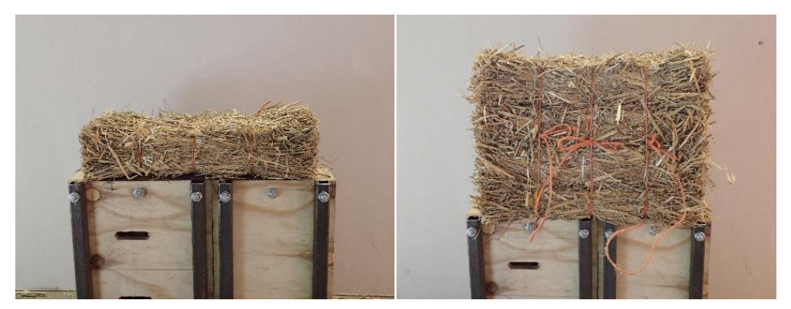
Fig. 5: Prototype bales