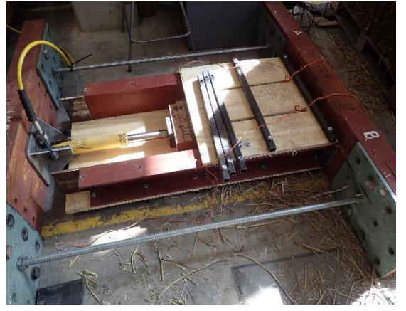
Fig. 3: Set-up for compacting prototype bales.

The prototype bales have been compacted within a timber and steel braced former using laboratory Enerpac hydraulic jacks. The low stiffness of loose straw requires large displacements of compacting jacks, which has limited the dimensions of the resultant bales. The initial prototype has undergone several changes during the concept initiation. Following initial design for vertical compaction the current set-up uses a horizontal form (400 mm width with 100 or 150 mm height). Each derivation came from a particular need in the production process. Initially this meant primarily producing prototype based on the physical requirements for thermal conductivity testing. The prototype further evolved to consider methods of construction and still further to incorporate mechanics of the straw and potential upscaling (Fig. 3). Figure 4 shows the set up