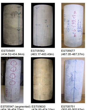
Figure 2: Cores taken from the Callovo-Oxfordian argillite at MHM- URL

Core samples of 100 mm diameter and 320 mm length (Fig. 2) Zhang et al. (2004 )were taken at different depths between 434 and 506 m below the surface from the drillcore of the borehole EST205 drilled at the axis of the auxiliary shaft of the MHM-URL (ANDRA, 2005)